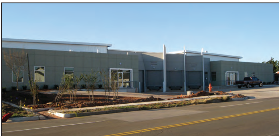
Service Center at 300 N.E. 50th street. Photo taken on Nov. 6, 2009.

Make sure not to place any item routed to CAT in CH bins.