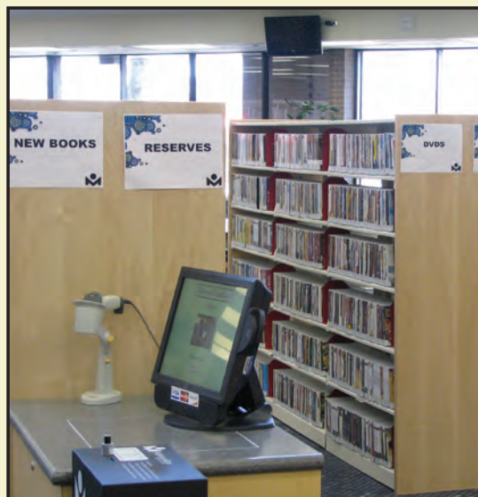
At right: new reserves check-out system.