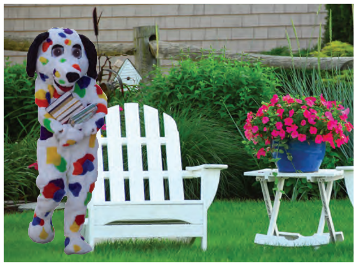
Spoticus getting ready to sit down and read some good books he checked out at the library.