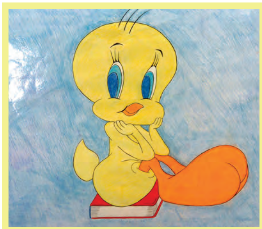
These Fan Art pieces were created by students, ages 16 to 17, who attended art classes at Grant High School.