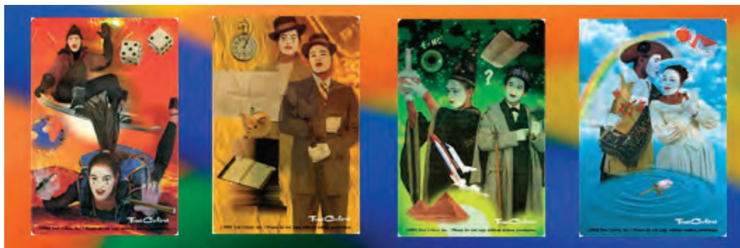
The four types and color cards of the True Colors system.

"True Colors helps us recognize and appreciate our unique strengths and preferences," Heidi continued, "and the unique