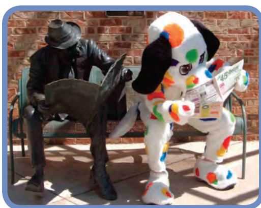
COPY CAT! Spoticus seen here at Edmond. He greeted many young readers at the beginning of Summer at the Library.