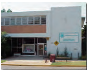
Capitol Hill Library, home to Tech Processing & Cataloging.

DN Library staff breathed freely for the first time in years when they moved into their new building, but other MLS staff feel constricted and look forward to a time when they, too, gain some elbow room.