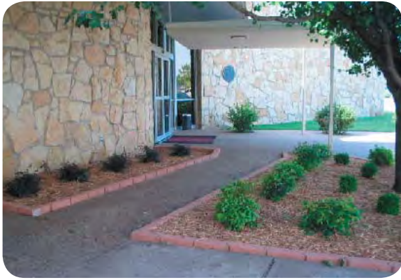
Belle Isle Library received a face-lift for its front door.