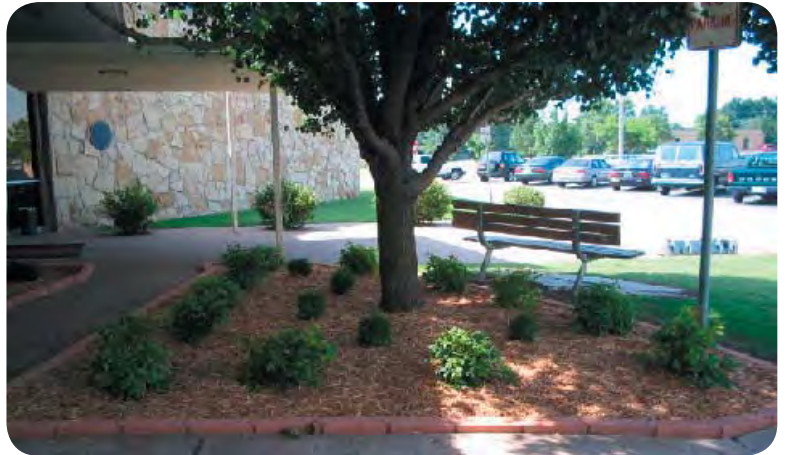
A shady bench beckons customers.