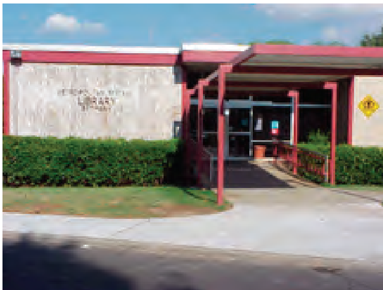
Bethany Library at 3510 N. Mueller