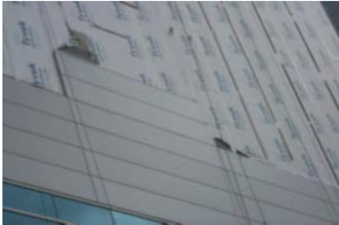
Buckner and Moore, Inc. contractors for the Downtown Library Learning Center has resumed the installation of the exterior wall panels as of April 24.