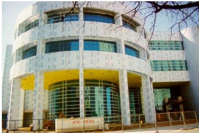
Photo taken in early April of the Downtown Library Learning Center.