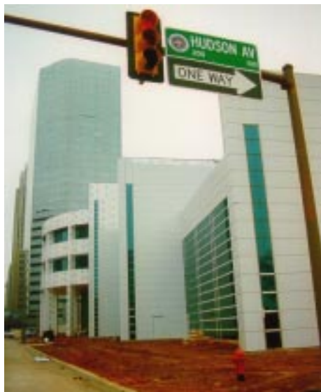
View of the Downtown Library / Learning Center at Park and Hudson.