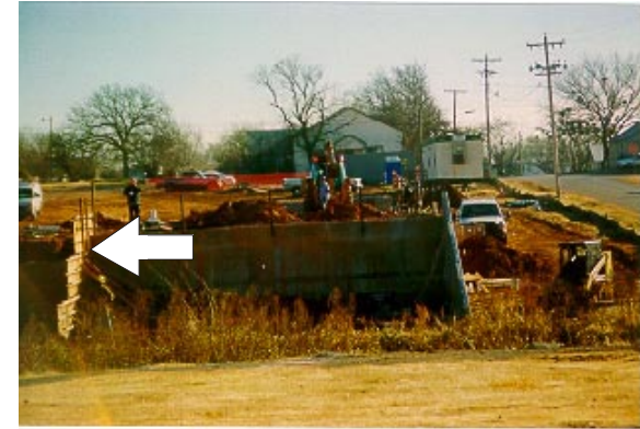
Same area looking east.