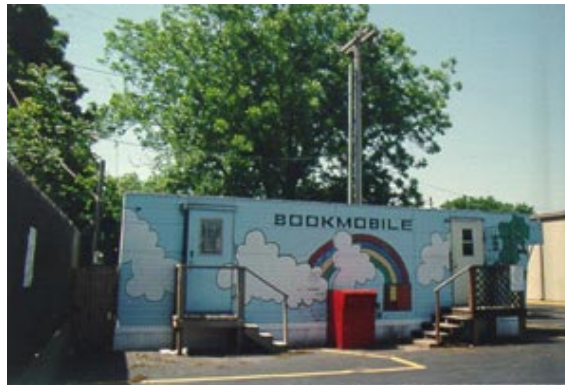
MLS's Drexel Extension Library is shown in an earlier photo. The Extension will officially close March 3.

"The Drexel Extension is housed in a 40-year-old trailer," she added. "These trailers were once used as mobile libraries, but with the comprehensive