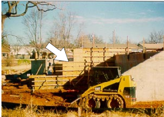
Choctaw Library - west end looking north. The arrows identify the concrete form work needed to construct the west steps which lead up to the west entry/porch area.

This means the finish work, when it starts, will appear to fly.)