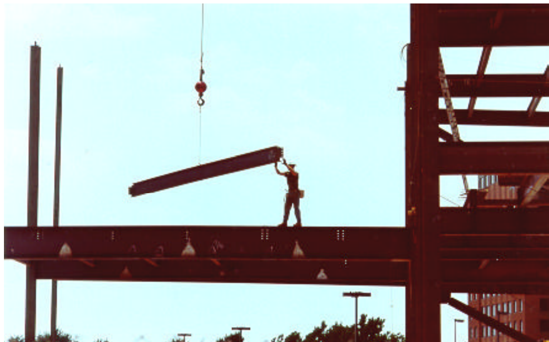
The Downtown Library Learning Center is slowly looking like a real building. The building's steel frame is going up!

Call 231-8618 if you would like a copy of the list.