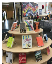
Ralph Ellison Library

Ralph Ellison staff talked at length about how they would incorporate the theme, "Libraries Rock" into their everyday activities and came up with a music by the decade themed