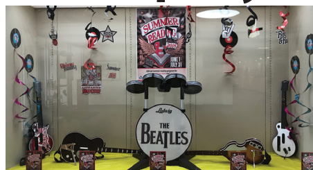
Del City Library

costume day for each week of summer reading.