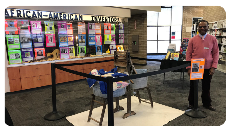
Black History Month Display at Southern Oaks