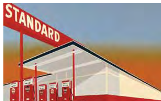
Ed Ruscha’s color screenprint, Standard Station.