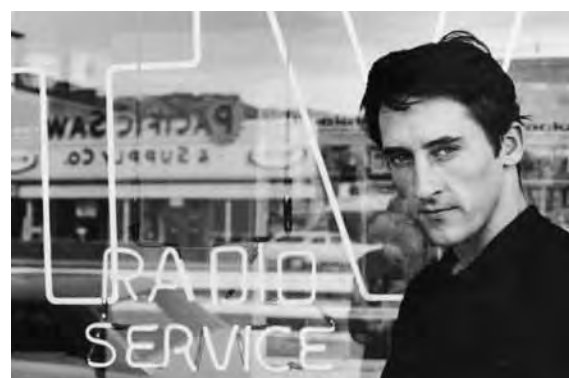
Ed Ruscha in the 1960s’.

have simply not produced noted artists in the way that we have sports and entertainment stars.