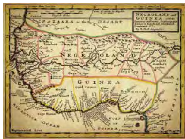
1729 map of and inland region of West Africa.

to Galveston, Texas. Meanwhile, potential settlers sold all of their land and belongings and huddled in stark privation in tent cities near Weleetka. Starvation, cold, and disease swept the camps, many succumbing to a smallpox outbreak.