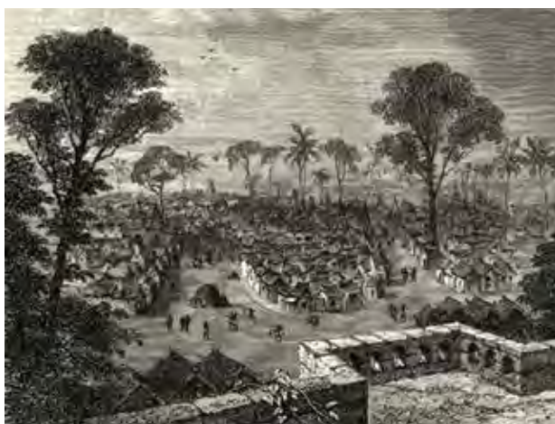
Africa's Gold Coast

Oklahoma's all-black towns are unique to our area because of the sheer number of them. Beginning with Freedmen from the Five Civilized Tribes, former slaves established self-governing and self-supporting towns around the territory. Later, as the post-Civil War South proved ever dangerous, droves of African Americans joined the existing towns or formed new ones of their own. Some even held hopes of an all-black state made up of former slaves and their descendants. In all, more than fifty towns formed.