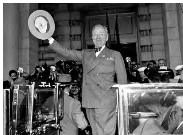
President Harry Truman opens the UN Organizing Convention in San Francisco in 1945.