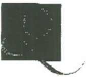
Saundra Naifeh Mayor, City of Edmond

Committed to enhancing the quality of life through quality public services.