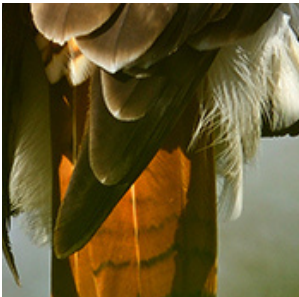
5) ERD LEDTAI WKHA