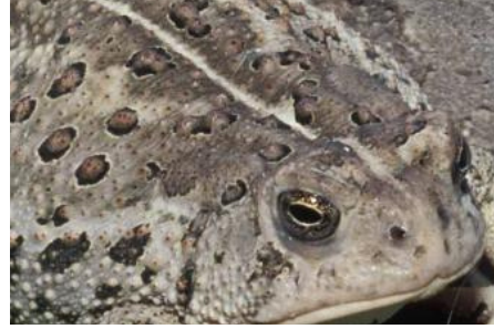
2) UOHSADOWOE TADO