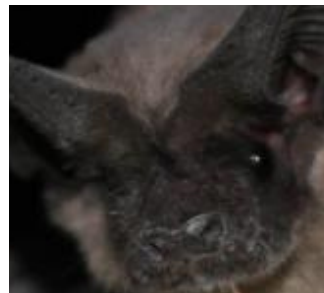
8) XNAMICE IFATEDLERE ATB