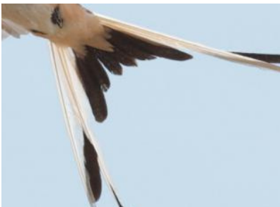
7) IDSLTOESASCIR FRTCACEYLH