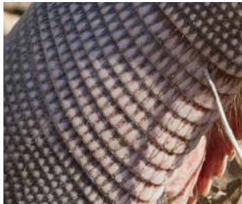
6) EINN AEBDND AOAMDILRL