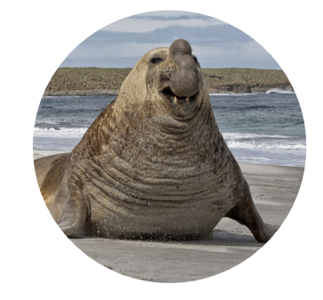
Southern Elephant Seal