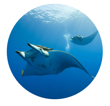
Chilean Devil Ray