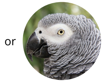
Hippopotamus African Gray Parrot