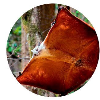
Giant Flying Squirrel