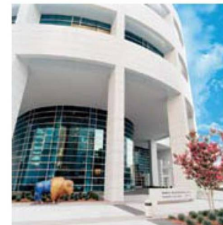
The Ronald J. Norick Downtown Library

Did you know that when you visit one of our libraries, you are in a very real sense visiting them all? All 17 of them constitute a system. Here's how it works. Say you usually use The Village Library. Now that sounds like a library that is a function of the City of The Village, or maybe just for the needs of the citizens of The Village. We like to call it their neighborhood library, but