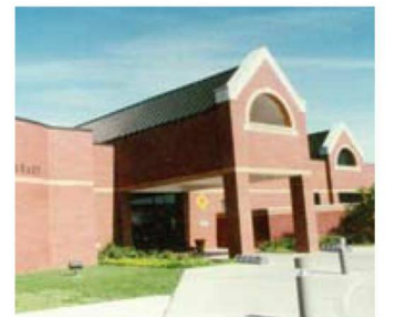
The Village Library

Now, it's just the way we do business every day.